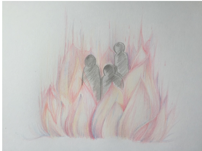
Artist: Celia Pringle – Charlotte, NC Congregation