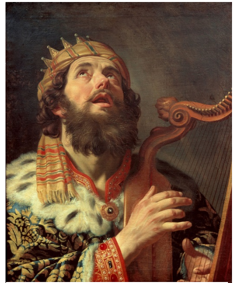
Gerard van Honthorst artist QS:P170,Q314548 Gerard van Honthorst - King David Playing the Harp - Google Art Project , marked as public domain, more details on Wikimedia Commons