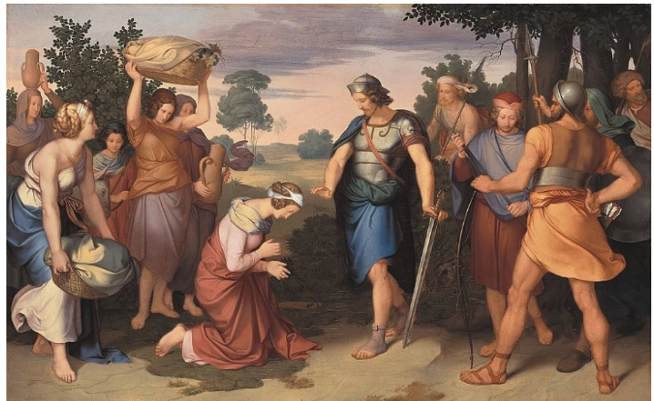
Moritz von Schwind artist QS:P170,Q551901, Moritz von Schwind - Abigail vor David - 13363