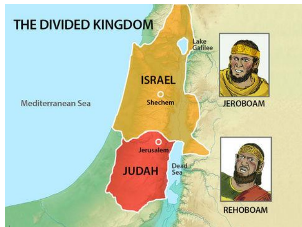
Sweet Publishing | FreeBibleImages.org