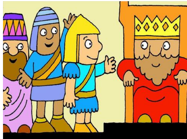
Richard Gunther (www.lambsongs.co.nz) | FreeBibleImages.org

Where do we read about the peace that the land of Israel enjoyed during his reign? (note that this introduces the child to the parallel account of the kings of Israel and Judah in 1 and 2 Chronicles)